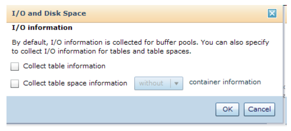
Figure 5 – I/O and Disk Space monitoring profile

As an example, let's look at the "I/O and Disk Space" profile. Figure 5 below shows the options that are available to collect finer detailed data for "I/O and Disk Space":